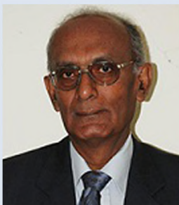
Mukund Reddy Oration

Title : “Efficient Management of Massive Lower Extremity Trauma”